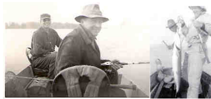
Art and guide trolling (l) and boating one (r) in the early days