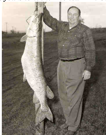
Partially frozen or weight?

Dettloff allowed in the photo analysis section of his report that this fish could have been ...59" long. It was 62 ½-inches long.