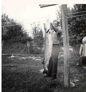
In my 1 st Compendium this 1950 fish was incorrectly shown as Lawton's 1944 fish

...In 1944 he broke the Field & Stream Contest with a 58 lb. 5 ounce.