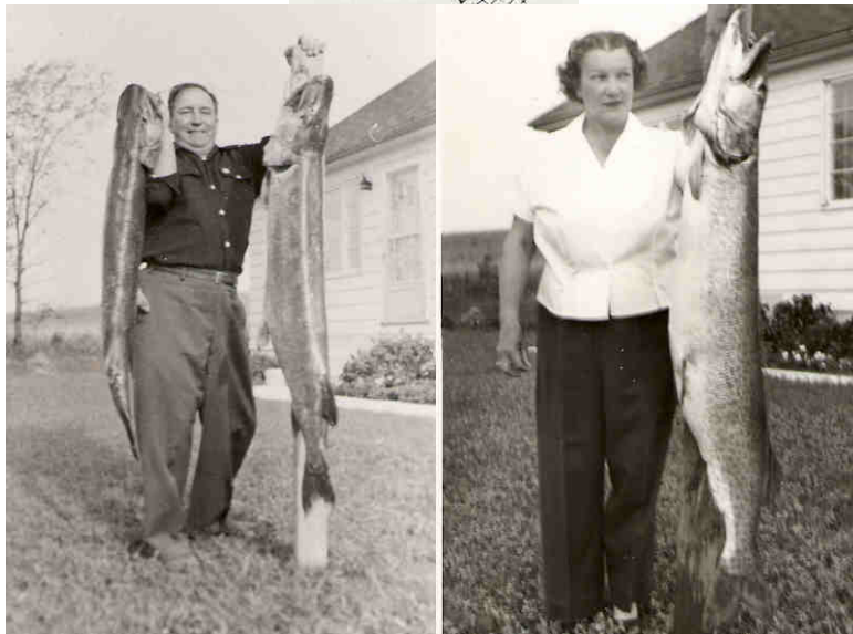
Two muskies – 112-pounds 13-ounces! Biggest fish in (l) photo s/a (r)

And now in the 1957 Contest, Lawton is back on top with a 69 lb. 15 oz. giant, a new world record.