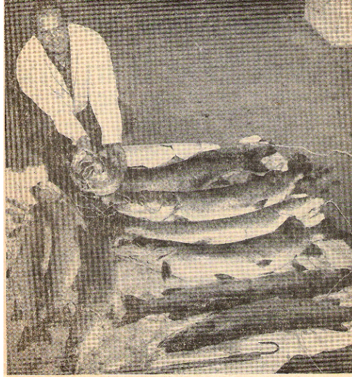
Art with 9 of the 10 showing