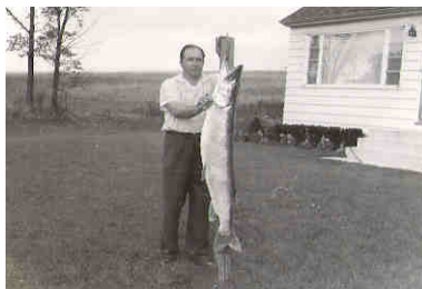
Dettloff photo #5. NOT the "commonly known" fish!

Using Dettloff's longest assumed length determination of the Lawton fish of 57 inches (Pg. 23) resulted in a calculated Side Width (SW) dimension of 9 inches. The calculations employed to determine this possible maximum 57 inch length were all made (by Dettloff) using estimated dimension calculations from several assumed measurement points on the Lawton "post photo" (Photo exhibit #5).