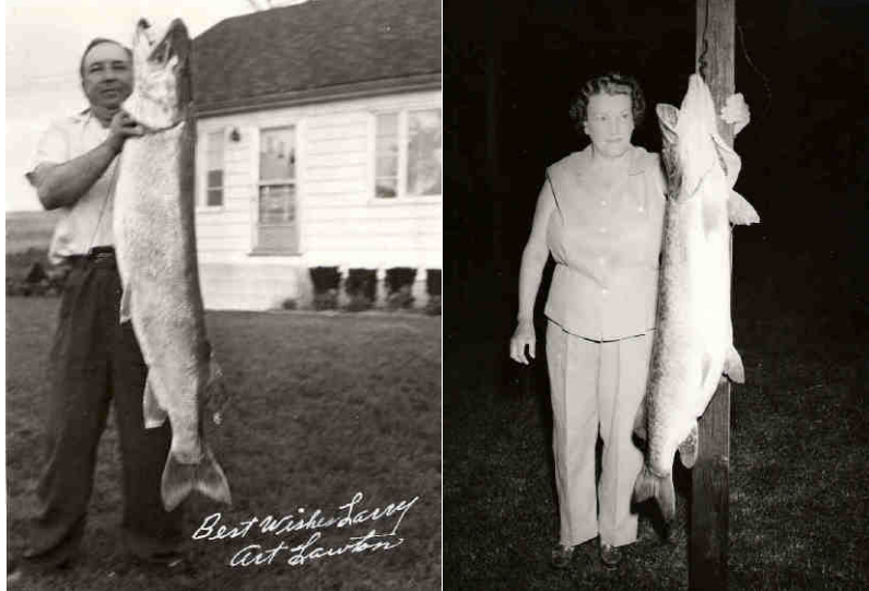
The "King" at 69-15 and The "Queen" at 68-5 First and Third on the All-Time List!

Below is length and girth information on the 1955 fish, two of their 1956 fish and the 1957 record fish.