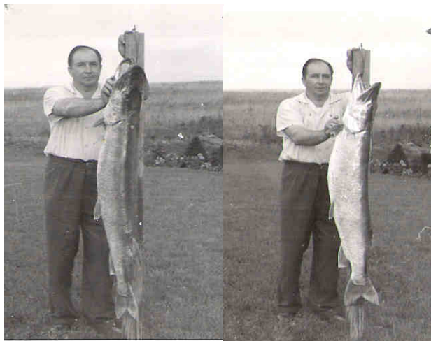
An IGFA official agreed that this fish was different