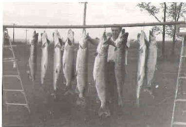
Dettloff photo #7

*As an experiment, I used Dettloff's method of calculating the fish's length (Dettloff photo #7), and I came up with a result of 58½ inches. Then adding the missing 5 to 5 ½ inches to my result, I came up with a total fish length of 63½ to 64 inches ...only 1 or ½ inch below Lawton's claim.