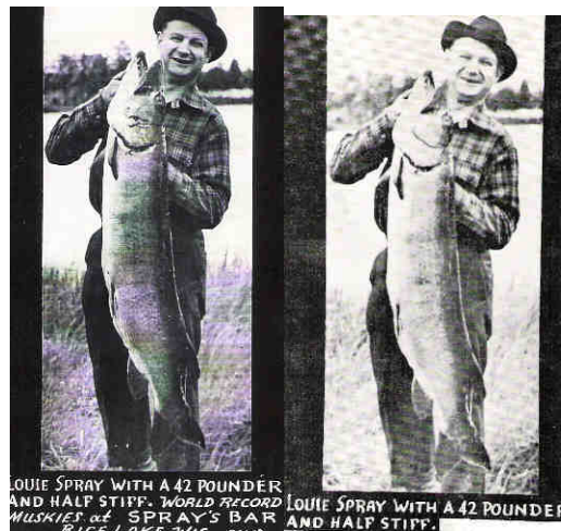
The post card on left is the referenced card. The post card on the right is yet another altered version