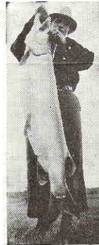
59 1/2 lbs. — 1939