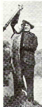
Droite World Record, 1940 61 lbs. 13 oz.