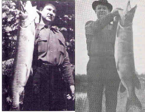
24# from 1924-----Unspecified