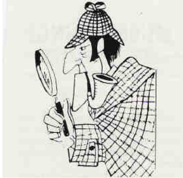
Where's the pictures of Louie with his '39 fish?